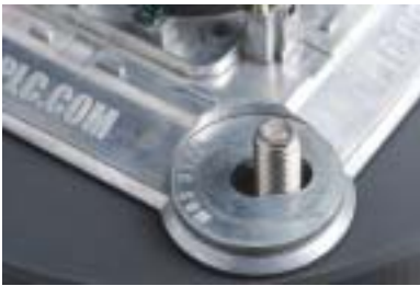
Mounting Rings In Place

-4 Mounting Rings and 4 Stainless Steel Washers (mounting bolts and nuts not included)