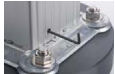
5/32" Hex Wrench Used To Lock/Unlock Pedestal

The IP3 Pedestal is anchored using the universal mounting rings provided allowing for a wide range of bolt patterns from 6" to 7" spacing. Standard bolt size is 5/8". To mount, position the enclosure over the mounting bolts in the concrete base and place the mounting rings over the bolts rotating them until they fit in place. Install the stainless steel washers provided over the bolts and finger snug the mounting nuts (not included) before tightening.