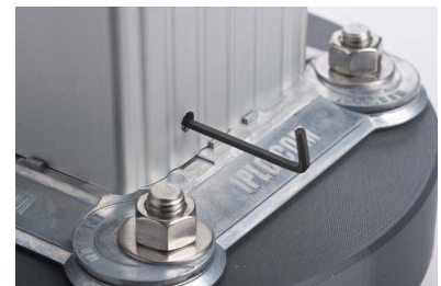
5/32" Hex Wrench Used To Lock/Unlock Pedestal

The IP3 Pedestal is anchored using the universal mounting rings provided allowing for a wide range of bolt patterns from 6" to 7" spacing. Standard bolt size is 5/8". To mount, position the enclosure over the mounting bolts in the concrete base and place the mounting rings over the bolts rotating them until they fit in place. Install the stainless steel washers provided over the bolts and finger snug the mounting nuts (not included) before tightening.